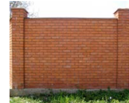
Brick & Masonry