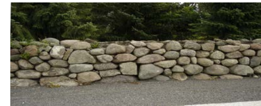
Stone, Rock & Concrete Block