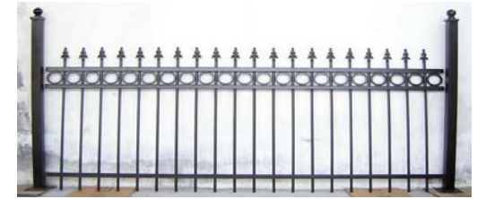
Wrought Iron and Decorative Aluminum